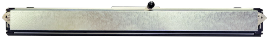
Interior View: The inside assembly features a metal cover which protects the inside release handle mechanism from incidental contact. Shown mounted on our standard 5" extrusion.