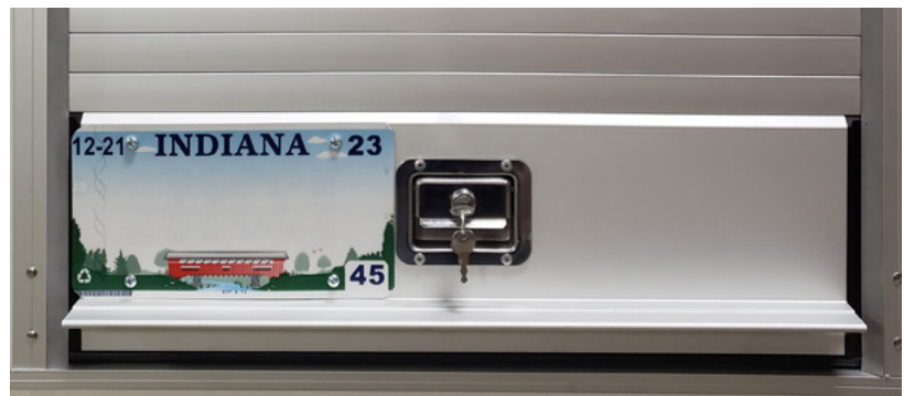
License Plate Mounting Option