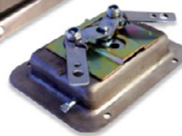
Interior of lock mechanism